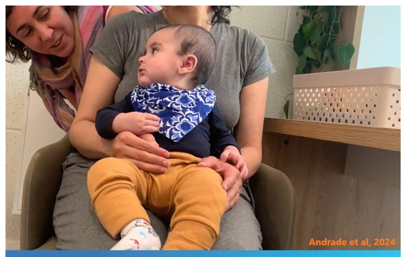
Image 3: Baby locating the evaluator's voice.

We have presented a little more about the audiological procedures used in children, and we now invite you to continue with us on this journey of exploring children's audiological assessment by reading our forthcoming bulletins.