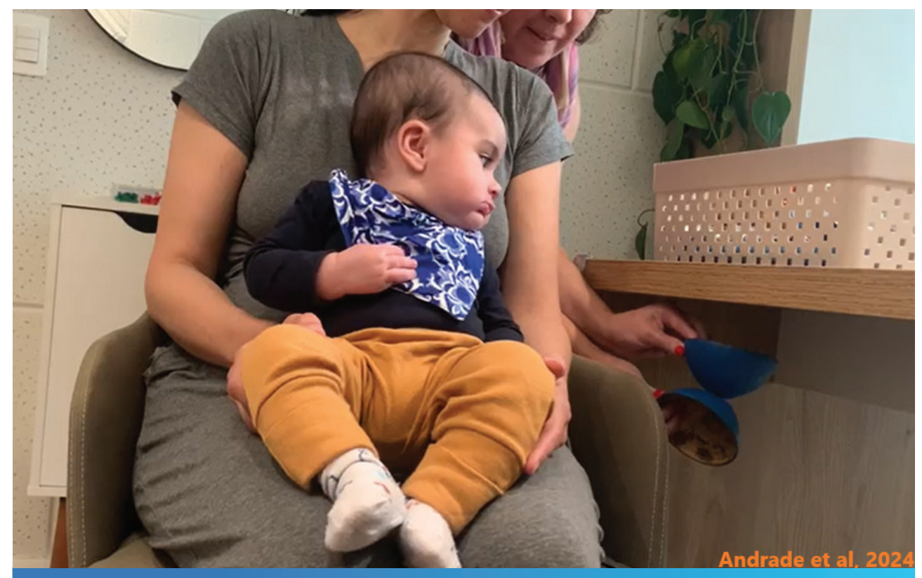
Image 2: Baby tracking to the left in response to a sound from the coconut instrument.

The tests mentioned above enable a diagnosis of hearing loss, which is the first step in beginning auditory rehabilitation. However, such procedures do not provide any information on the child's auditory behavior, and this aspect requires observation and behavioral assessments.